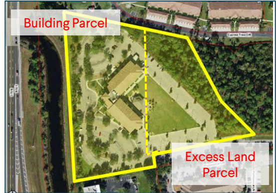
Property Lines are Approximations